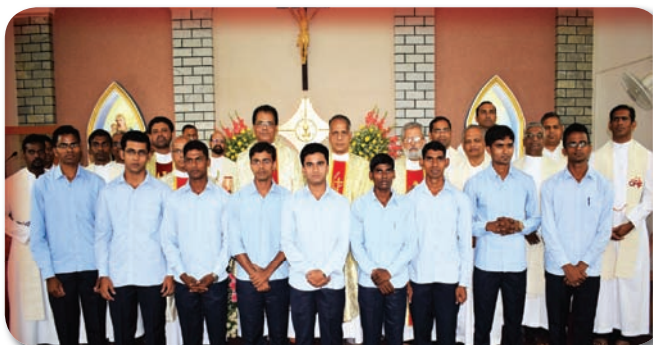
On 31 May 2017 nine of our Novices make their First Profession at Claret Bhavan, Carmelaram.