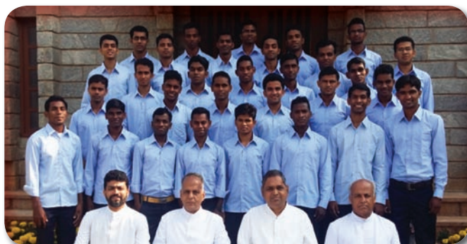
2016-17 Batch of the Novices with the formators.