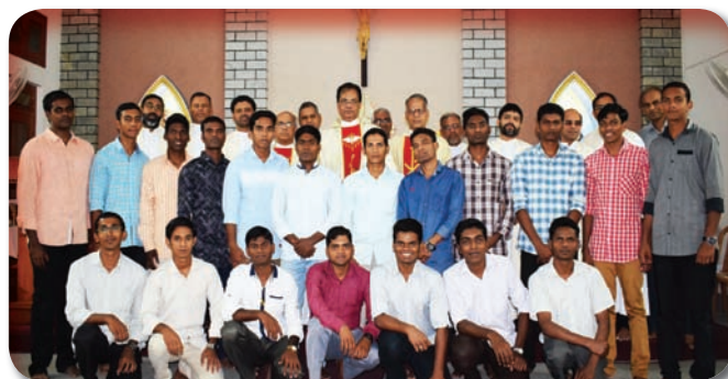
New batch of Novices for 2017-18.